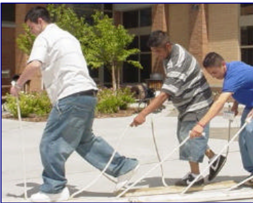
Above: Students use teamwork to master the trolley.

Migrant students from across the state attended the 2005 State Student Leadership Conference, June 15-18, 2005. During the conference, students and staff seized the opportunity to practice newly developed leadership skills. The large group sessions and the impromptu talent shows are popular and fun activities. Participants share dramatic, music, poetry and dancing talent—in serious and comical roles; take risks to lead groups; explore team building and relationship skills in small groups; learn new problem solving, goal setting and communication skills. Students like those in the photos below will go on to serve their schools, families and communities by exercising their newly formed and refined leadership skills.