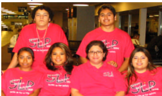
Brewster students and staff pose for an airport photo.

Ten students and two chaperones from the Brewster and Oroville School Districts attended the Bert Corona Leadership Institute in our nation's capitol in November 2004. Upon return, students from Oroville made presentations to the school board, local PAC, and an all-school assembly. They activated the ARC club (A