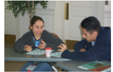
Students working together at State Student Leadership Program conference held February 23-March 3. Eighty-four students attended.

nationwide. To learn more about replicating the leadership program, or for tips and support on integrating migrant student leadership into existing programs, call SEMY.